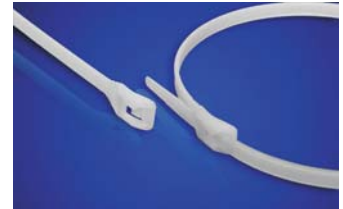
Pawl support is required to obtain optimum tensile strength.

Flexible head design provides maximum strength while the head easily flexes around the circumference of the tubing or bundled wires.